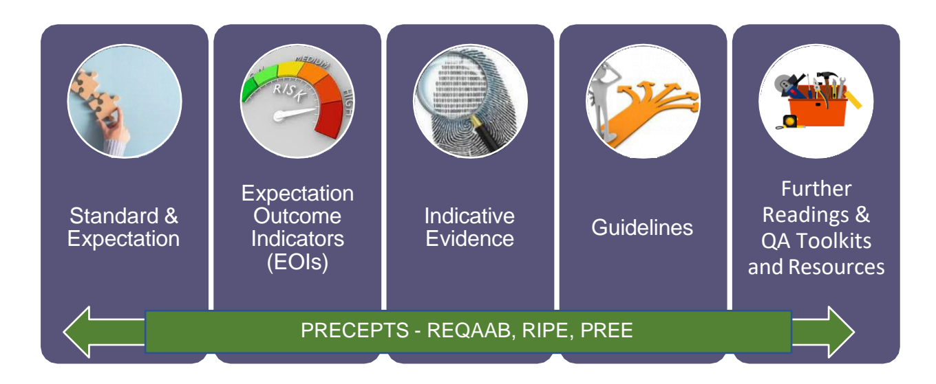
Figure 3: The key elements of the precepts

These key elements of the Precepts are carefully designed and developed in order to make it easy for all the stakeholders to understand and implement Precepts and their execution for review, ensuring the effectiveness of implementing standards and monitoring practices.